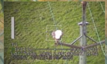
Equipped with different camera types the Corona 350 can easily detect both corona and hot-spots.

The Corona 350 is a gyro-stabilized gymbal containing four different cameras: an Ultraviolet camera for corona detection, a thermal imaging camera for detecting hot-spots in powerlines which can lead to costly breakdowns, a visual light camera and a digital frame camera. The Corona 350 is the ideal instrument for aerial power line inspections.